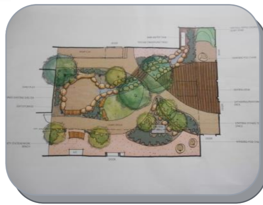
Middle Preschool Outdoor Area