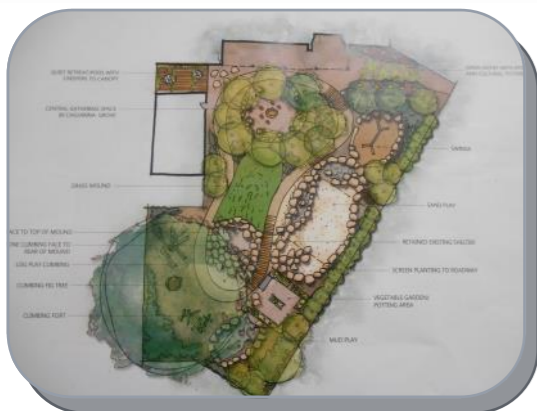
Main Preschool outdoor area visible from Haynes road